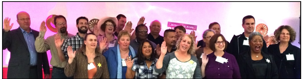
SCEA & YCEA BOARD MEMBERS RECITE THE OATH OF OFFICE AT THE EVENT